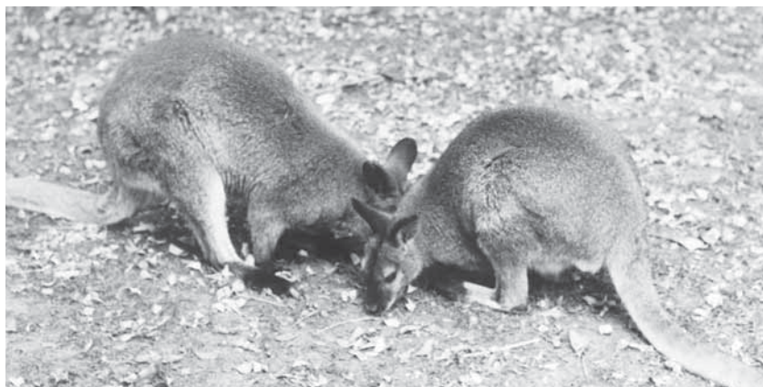
Plan now for a visit to Australia, where wallabies like these make their home. The IOHA will welcome you in Sydney in 2006.