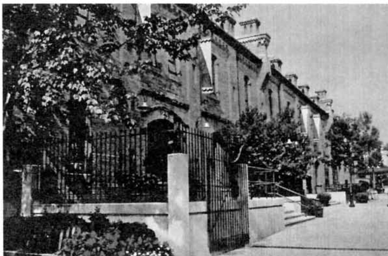
Brightleaf Square in downtown Durham, N.C., five blocks from the OHA conference site, is a turn-of-the-century, neo-Romanesque tobacco warehouse renovated as a unique shopping, dining and entertainment district.

+ the African-American experience in Durham, with visits to the Hayti Heritage Center, among other sites;