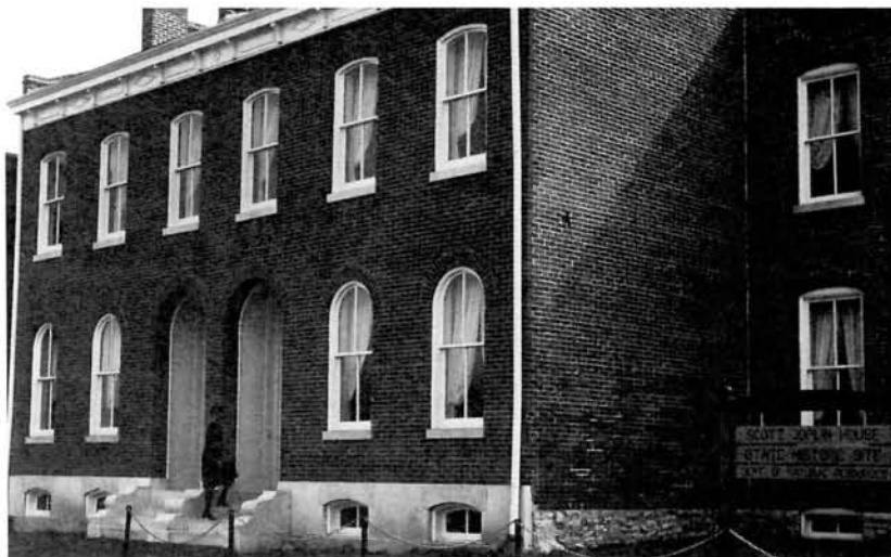
The Scott Joplin House Missouri State Historic Site pays tribute to the "King of Ragtime," who spent several of his most productive years in St. Louis at the turn of the century.