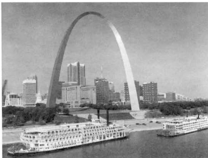
The landmark Gateway Arch soars over the St. Louis skyline.

Send to: 7524 S. 35th St., Lincoln, NE 68516. Fax: 402-420-1770. E-mail: OHAEditor@aol.com.