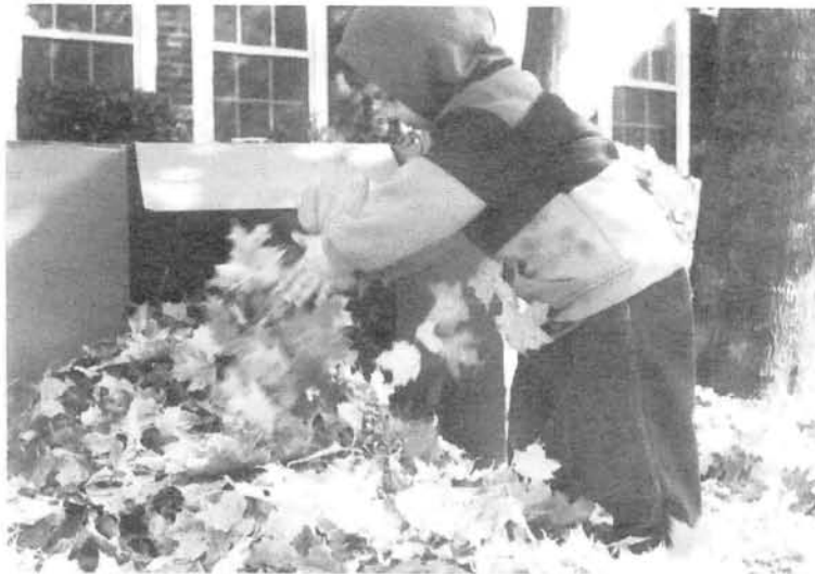
You, too, can enjoy autumn in the National Capital area when you attend the 2003 OHA annual meeting Oct. 8-12 in Bethesda, Md.

The conference will conclude Sunday after the annual business meeting, more panels and a plenary session on oral history programs and legal issues.