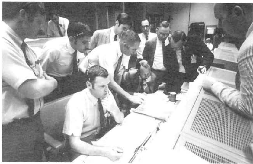
Flight controllers study a weather map to find a landing site for Apollo 13, after an on-board explosion caused cancellation of the lunar landing.

The book's companion CD-ROM serves as a repository of information about the space program and sets the stage for the International Space Station. It features more than 600 images, 145 video clips and animations, diagrams of U.S. and Russian spacecraft and 74 participant oral histories. Also available are the Shuttle-Mir and Shuttle mission status reports, mission summaries, NASA news releases, interviews, personal letters from the NASA Mir astronauts, science reports and other published documents used as source material for the book. The NASA