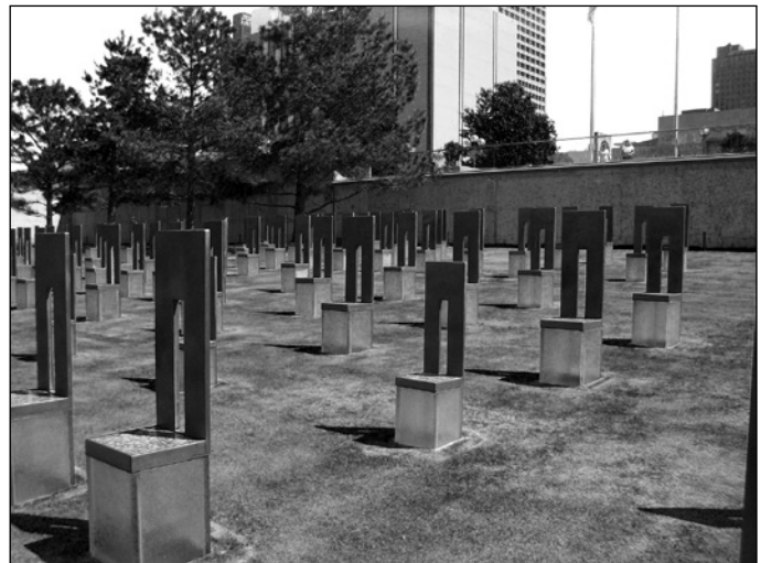
Oklahoma City National Memorial and Museum

Memorial ideas emerged spontaneously and immediately, he said, giving rise to quilt-making, tree-planting, concerts and athletic events.