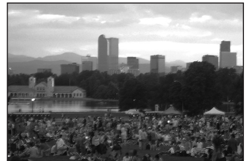
Denver skyline from City Park during a free summer jazz concert.