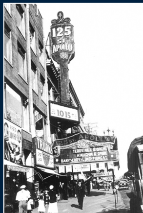
Apollo Theater, New York, NY