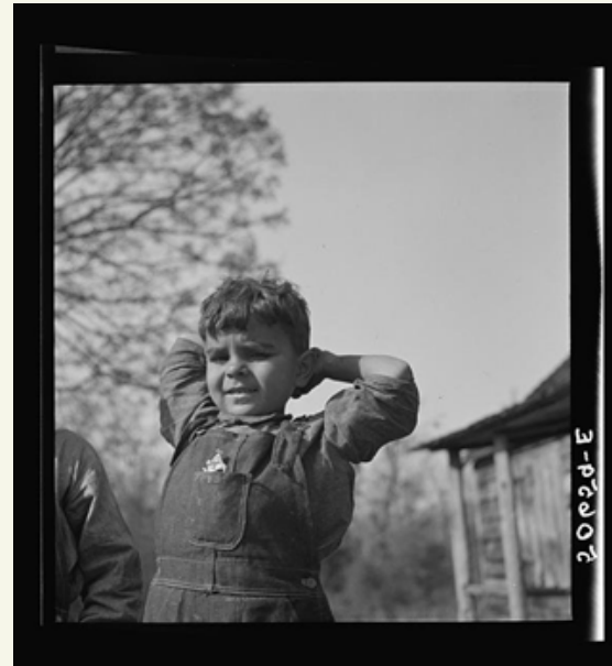
Unnamed Lumbee child from the photo collection of the Depression-era Farm Security Administration.