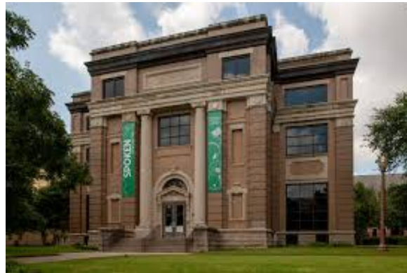
OHA's new home at Baylor University's Carroll Library