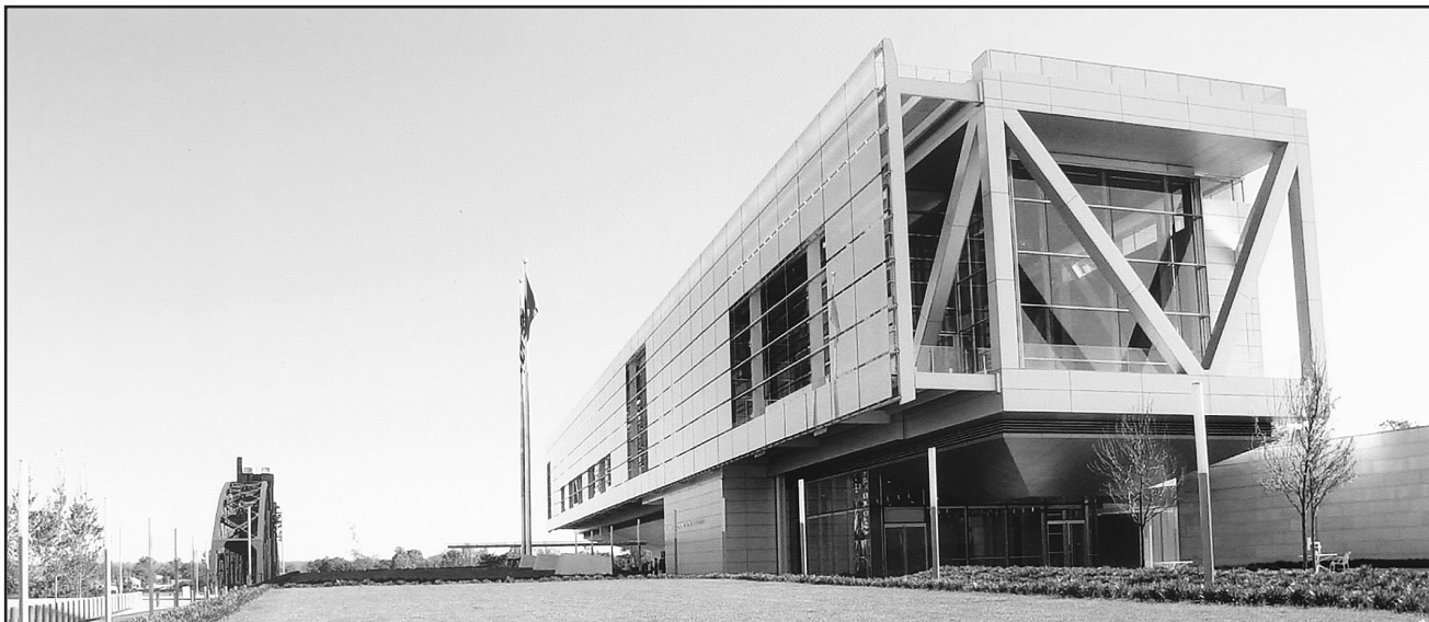
OHA conference attendees will be able to visit the new Clinton Center in Little Rock, Ark.