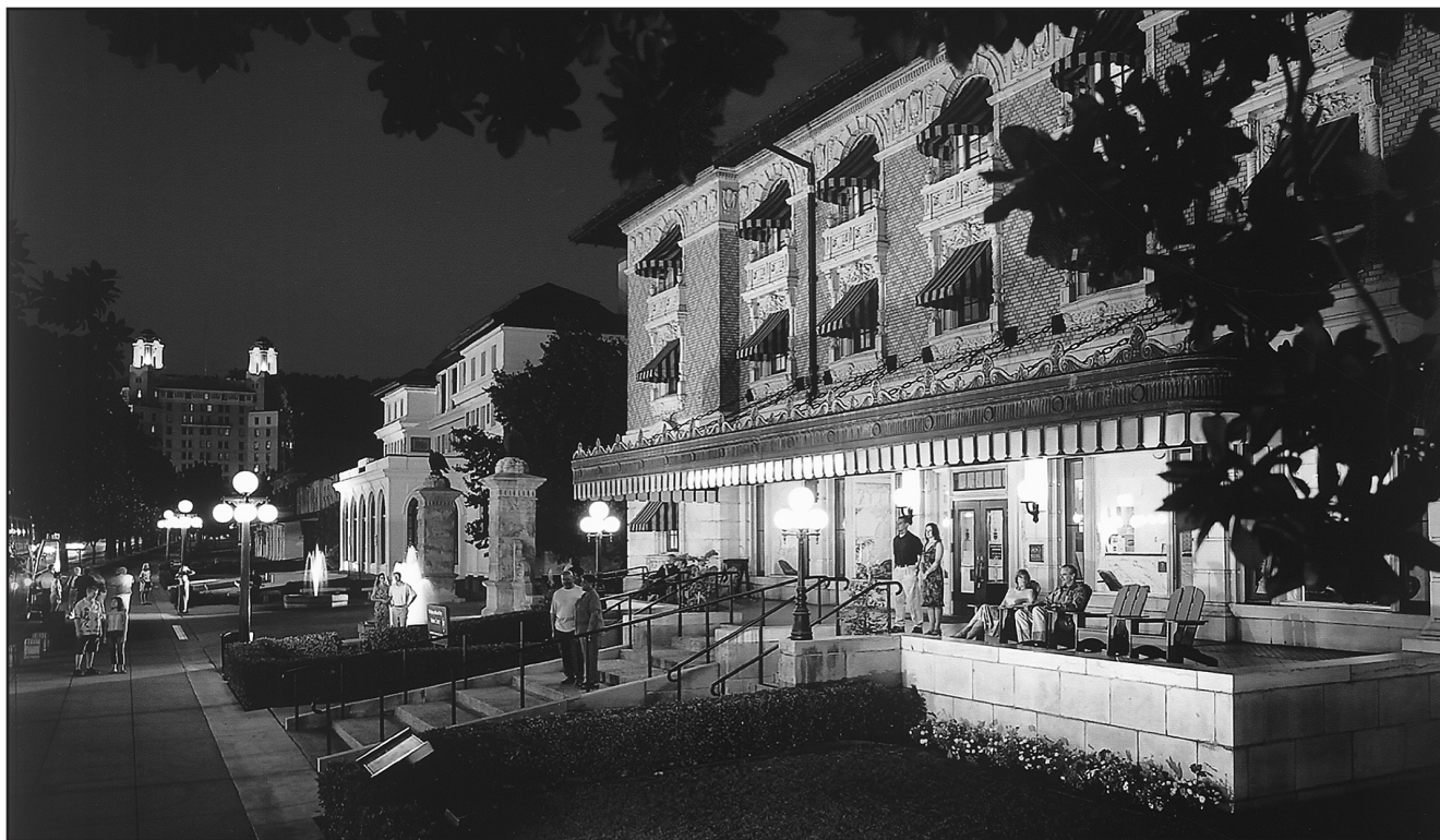
Hot Springs, Ark., shown here at night, is just one of the many Little Rock-area spots to visit when you attend the 2006 annual Oral History Association conference.

Other Saturday sessions will turn the spotlight on desegregation in Little Rock, the history of oral history and new legal issues facing oral historians. A Sunday morning business meeting will round out the conference.