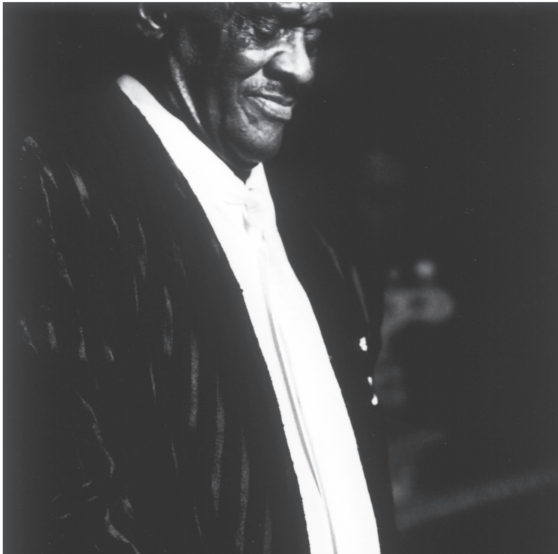
Blues musician Jimmy McCracklin.

“I was born in Arkansas. I was on a farm, you know. My dad had cows, hogs, chickens...that’s why I wrote ‘Arkansas.’ I made it to the true facts of actually what went down, when I remember, as I was a kid coming up.