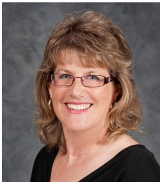
Co-Executive Directors' Report