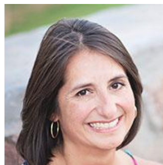
Executive Director's Report