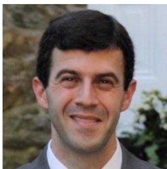
New OHR editors