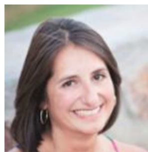
Executive Director's Report