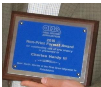
Award recipients to be honored